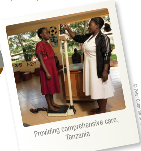
Providing comprehensive care, Tanzania