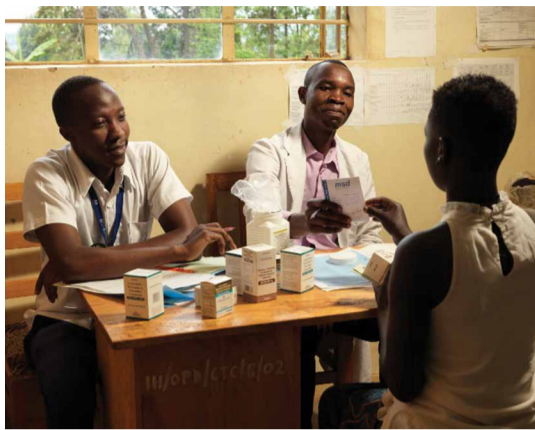
Delivering quality health services that young people want and need, Tanzania.